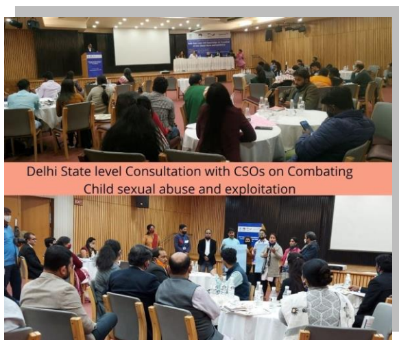
Delhi State level Consultation with CSOs on Combating Child sexual abuse and exploitation

Delhi State-level consultation on “Combating Child Sexual Abuse and Exploitation” was organized on 11 th Feb, 2021 at Indian International Centre, Delhi. To discuss various child related issues, different strategies to combat CSA, challenges in law enforcement, suggestions and recommendations for key stakeholders. NACG EVAC India took initiative along with CSOs/NGOs to mitigate the child protection issues.