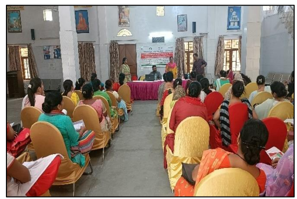
The training on 7<sup>th</sup> of June, 2022 with Frontline workers was held in North-west district of Delhi. 50 participants (2 male and 48 female) were present in the training. The session started by

Protection Workforce Capacity Building to End Child Sexual Abuse in India- Project Brief Training to front line workers on prevention of child sexual abuse and exploitation at New Delhi